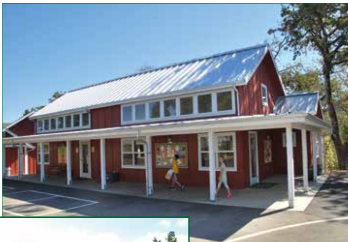
The Weber Building (left) houses the 4th grade as well as Lower School Mandarin