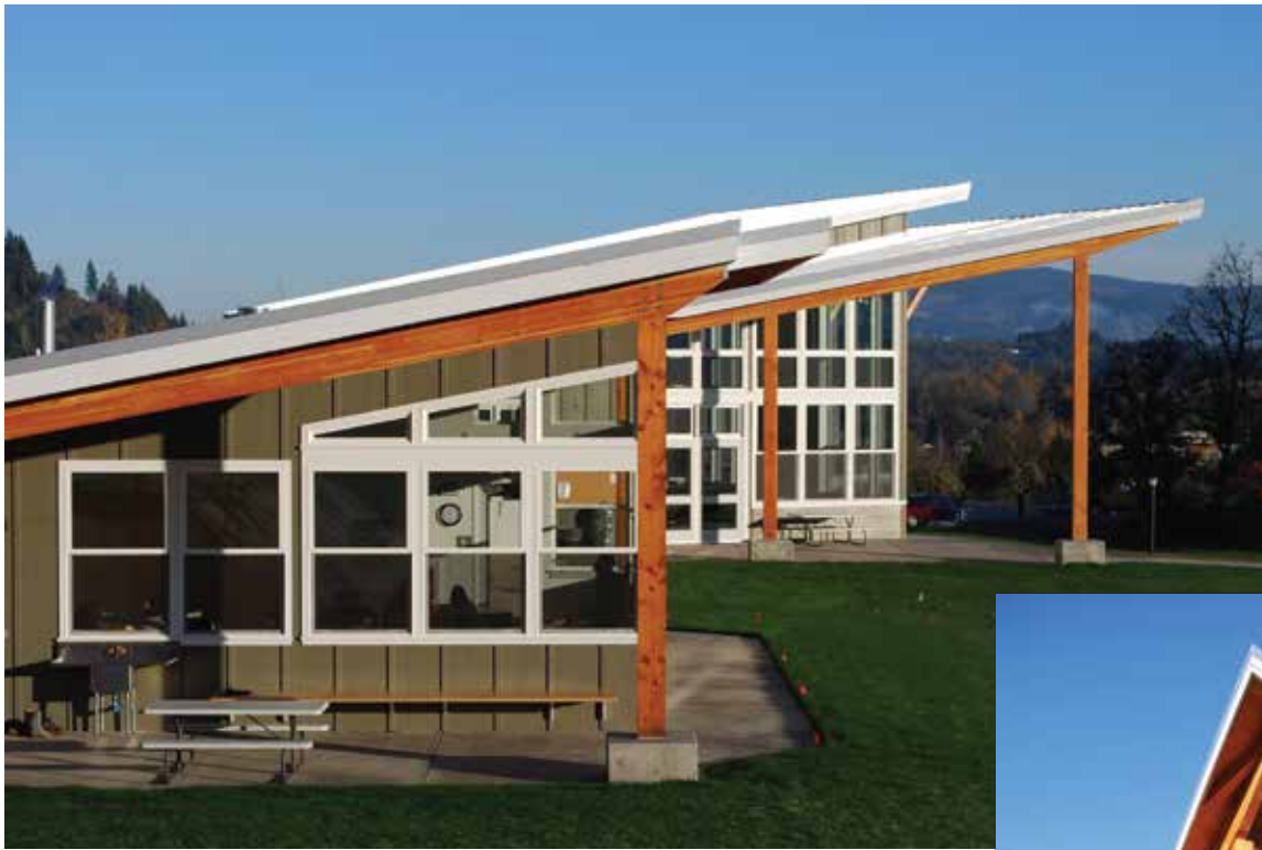
McGehee Building: This gorgeous building, completed in 2013, houses several upper school classrooms, plus the locker/study/meeting area (Sarkisian Hub) for the high school. The on-going challenge for the school is continuing to increase high school enrollment.

The search will conclude by December, 2018 and the start date for the new Head is July 1, 2019.