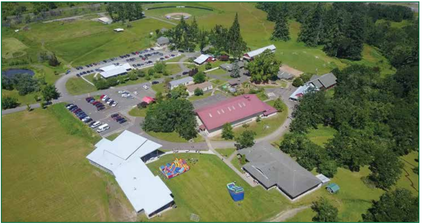
Oak Hill School Eugene, Oregon