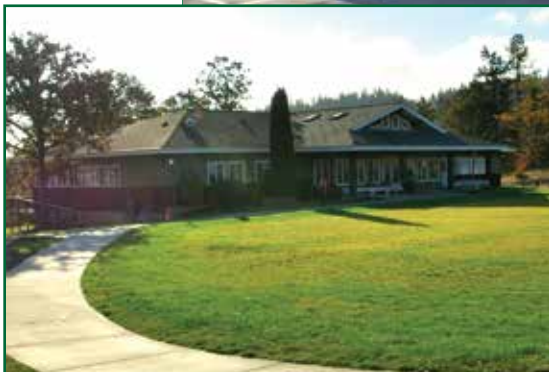
The McDonald Building (left) sees high usage as it is the location of the OHS 6th grade, MS Math, MS Social Studies, and MS Language Arts in addition to all Upper School Foreign Languages (Mandarin, French, and Spanish).