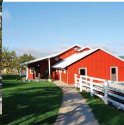
The Art Barn (above) is home to both Upper and Lower School Fine Arts classes