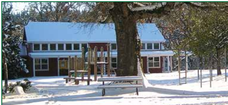
A snowy campus