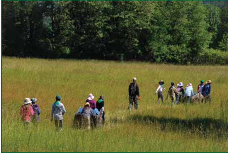
4th grade on the Oregon Trail

The NaturalWorld Program strives to uncover the mutual interdependence of all natural entities through fun and equitable discussion, bursts of inspiration, and practical applications. Over the student's six years in the program, this ecological perspective opens the possibility of becoming a self directed discipline in awareness; the result of which the mutual interrelation of all things and all events becomes a constant, life-orienting sensation.